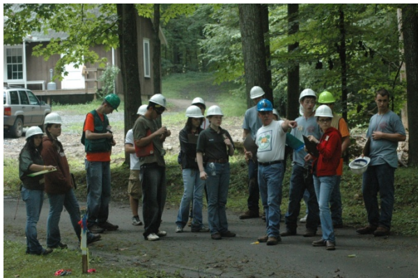
"Competitors at the 2007 4-H Forestry Invitational"