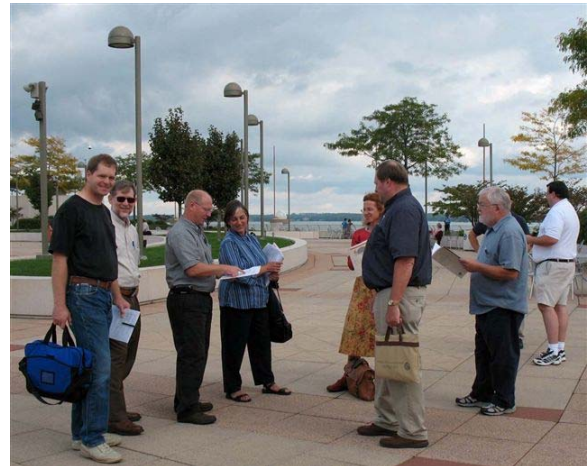
Some of Planning Committee members at Monona Terrace

Extension's Response to a Changing World -- "The land ethic at work today." It'll be May 20-23 in Madison Wisconsin at the Monona Terrace Community and Conference Center.