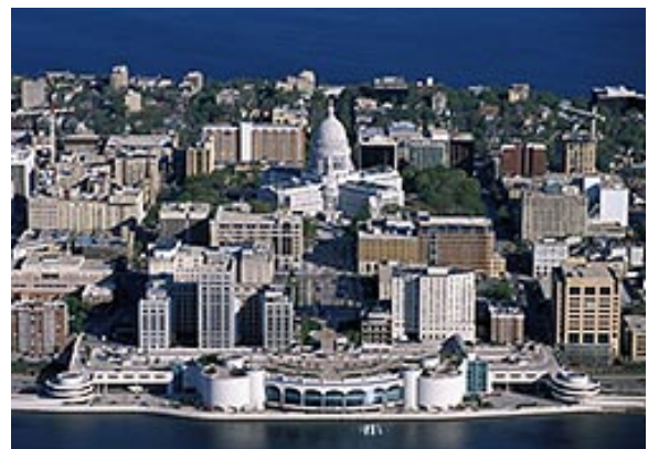
Madison, WI with Monona Terrace in foreground

This is a fantastic facility next to Lake Monona and best of all it is the first LEED EFs Silver Certified Convention Center in the US as certified by the US Green Building Council. If you want to take a virtual tour, go to http://mononaterrace.com/